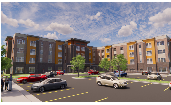
Perspectives by Grimm + Parker