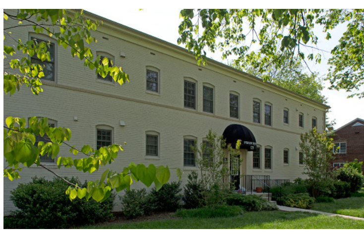
Fisher House I & II Apartment Mix and Affordability