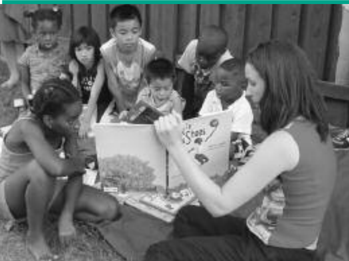
APAH volunteers orchestrated book parties for residents' children over the summer. Activities at the book party at Cameron Commons (above) began with group story reading. See "Residents @ Home" on page 3.