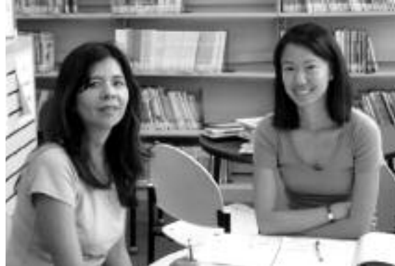
APAH resident teams up with tutor to learn English under Excel Program, setting an example of partnership and friendship.