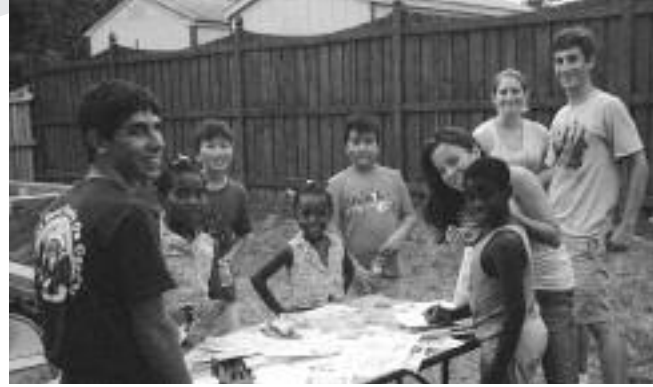
Young residents of Cameron Common Apartments create bookplates with help of Arlington college students at kick-off party for APAH’s free book distribution program.